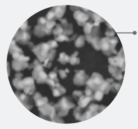
Free HA Particles AT X6000 MAGNIFICATION